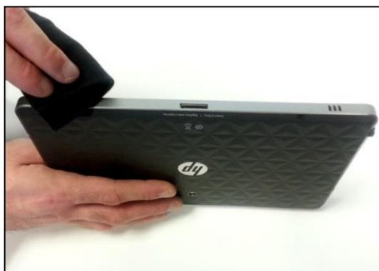
Figure 1: Cleaning the back and sides