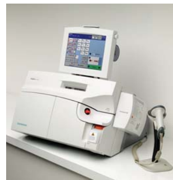
RAPIDLab® 1200 Blood Gas Analyzers are uniquely designed to meet your escalating throughput needs.