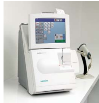
RAPIDPoint® 400/405 Blood Gas Analyzers deliver central lab accuracy with Point of Care efficiency.

Product availability may vary from country to country and is subject to varying regulatory requirements. Please contact your local representative for availability.