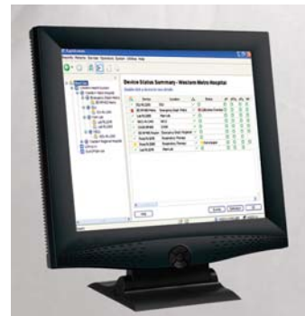
RAPIDComm Data Management Software gives you secure workstation access to all blood gas information – institution-wide.

Siemens Healthcare Diagnostics Inc. 1717 Deerfield Road Deerfield, IL 60015-0778 USA