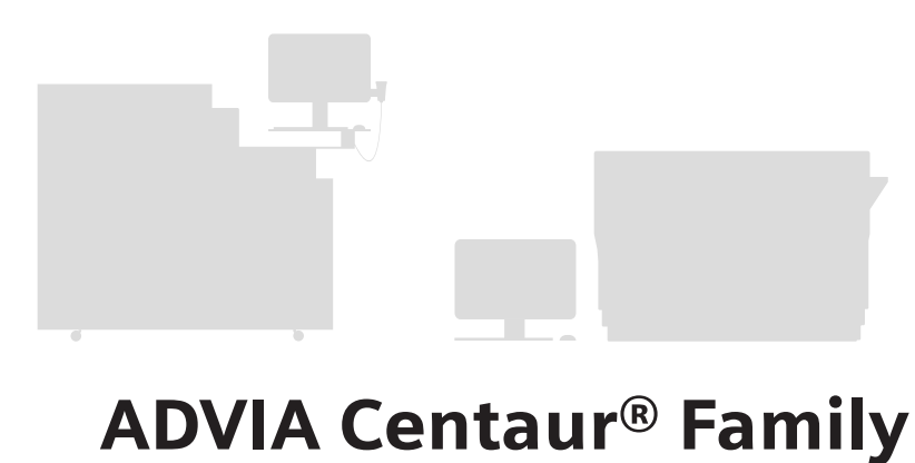
AD VIA Centaur ® Family