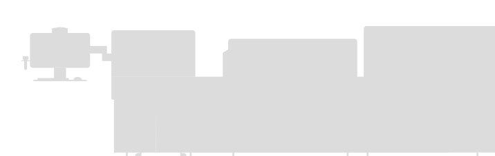
Atellica ® Solution