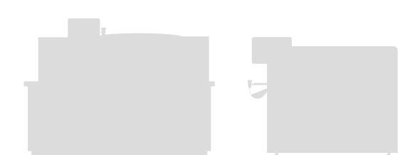
Dimension ® Family