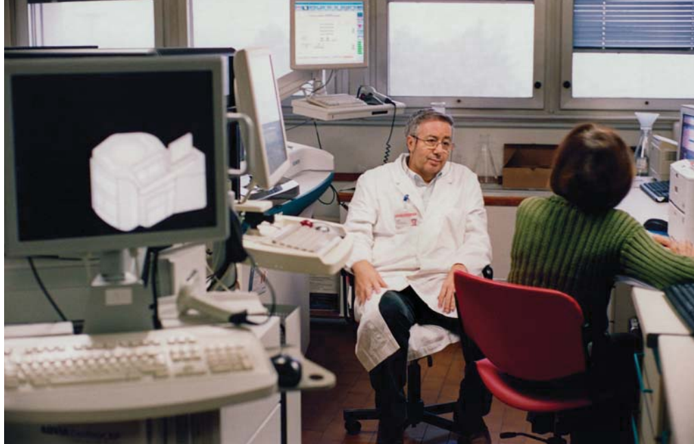
Due to the lack of space, line automation was not an option at CMEM.

the results, and provides a seven-day history of its movement," he reports. "It integrates the information from the two machines so that their results are visible in one place, on one report, as well as separately. It has reduced operator time by 43.7 percent, reduced the need for blood tubes by more than ten percent, improved speed by almost 25 percent compared to separate machine analysis, and improved our laboratory's relative productivity index (RPI) by 35.4 percent." The improved turnaround time has made doctors in and outside the hospital very happy. Patients are also happy because they don't have to give as much blood – a benefit for both the squeamish and the time-sensitive.