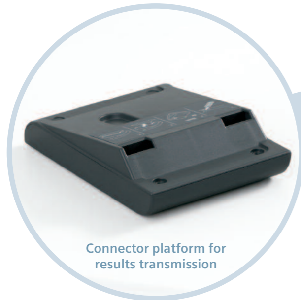
Connector platform for results transmission