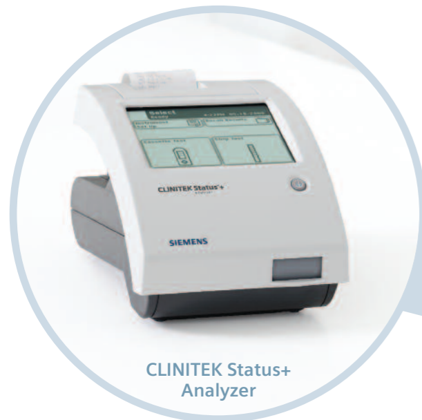
CLINITEK Status+ Analyzer