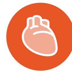
Infections of the Immunosuppressed