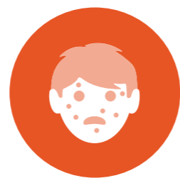
Fever, Rash, Childhood Infections