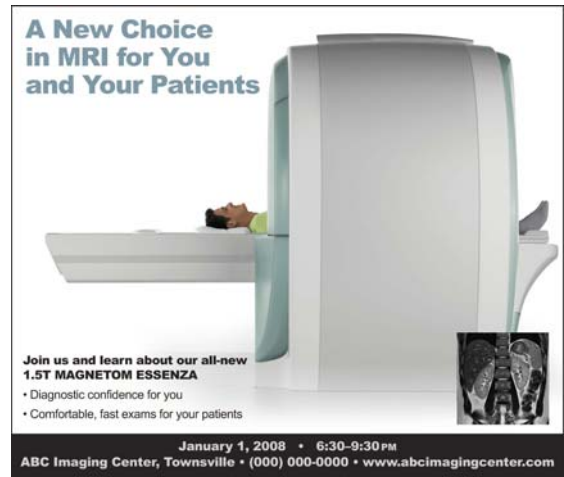
295,3 x 254 mm (color / b & w)