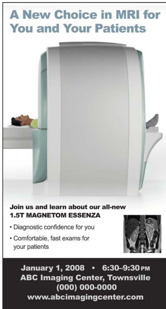
96,3 x 177,8 mm (color / b & w)