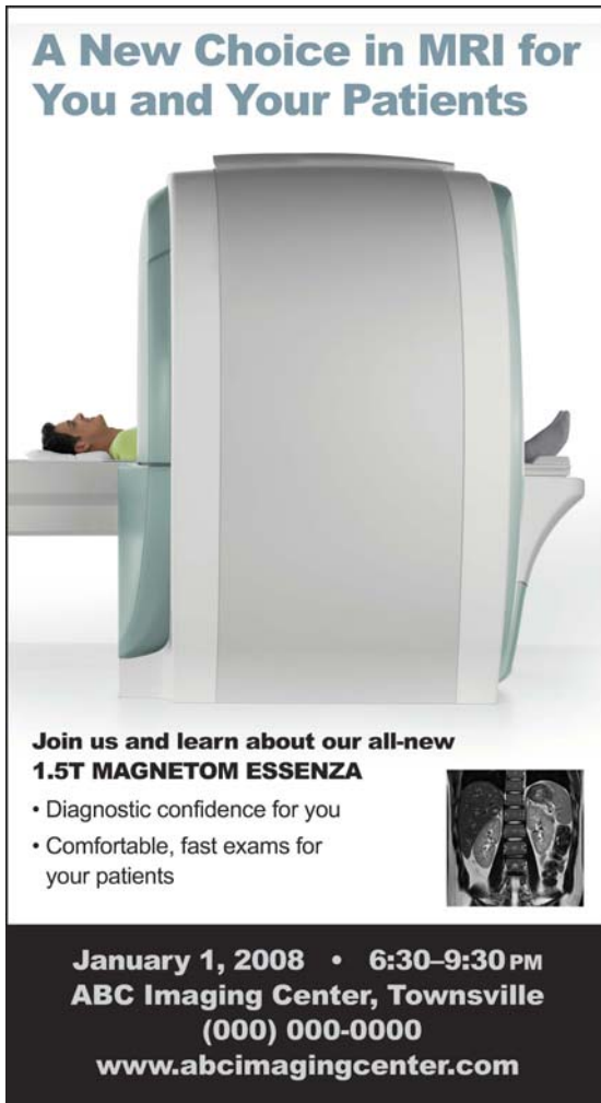
146 x 266,7 mm (color / b & w)