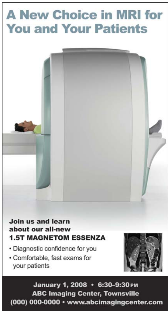
295,3 x 546,1 mm (color / b & w)