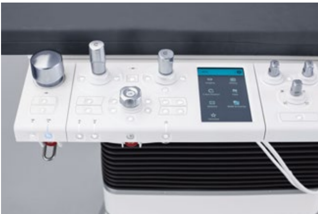
c) Control modules: • Joysticks, buttons, surfaces • Give attention to the gaps between