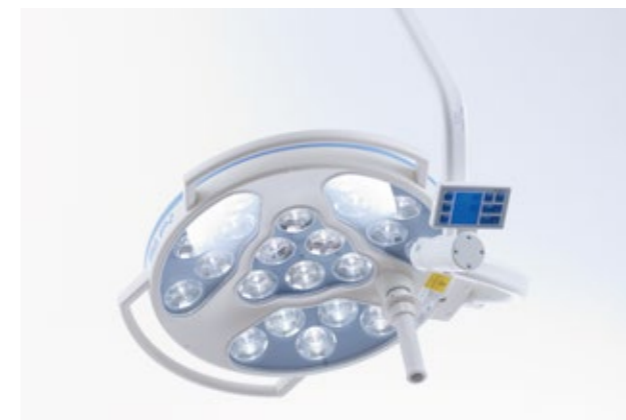
g) Operating light, in this order: • Illuminated area • Outer surface up to the first joint • Handles Work from clean to dirty areas.