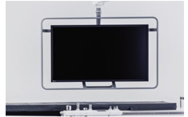
f) Handles of the monitors • Wipe from the top down in each case