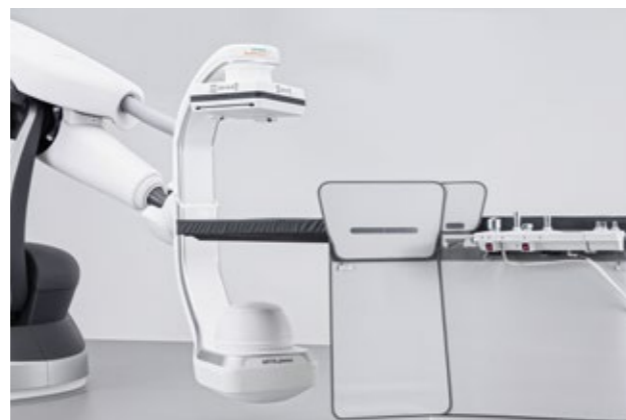
d) Upper- and lower-body radiation protection: wipe from the top down in each case