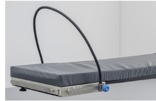
e) Positioning aids and any other accessories used