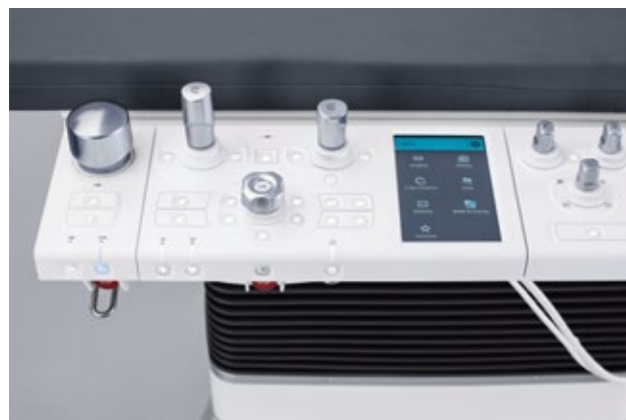
c) Control modules: • Joysticks, buttons, surfaces • Give attention to the gaps between