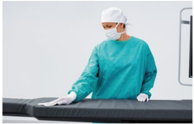
b) Patient mattress: wipe from head-end to foot-end