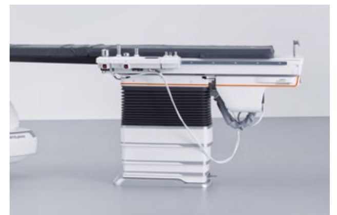
i) If necessary: • Base of the patient table • Trolley Wipe from the top down in each case