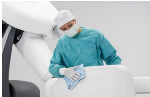
a) C-arm: wipe from detector to tube

In case there is visible soiling of the floor: disinfect the floor below and directly around the patient table. Use wet or impregnated dry wipes to disinfect the following surfaces, in the following order (a-i). Use the impregnated mops to disinfect the floor. Work from clean to dirty areas. The surfaces in the OR must be completely dry before entering. Dispose used wipes, mops and, gloves after you have finished cleaning.